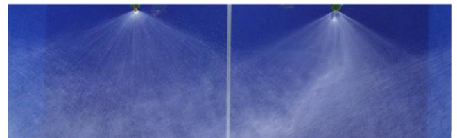
Glyphosate + AMS @ 8.5 lbs/100 g

Always read and follow label directions.